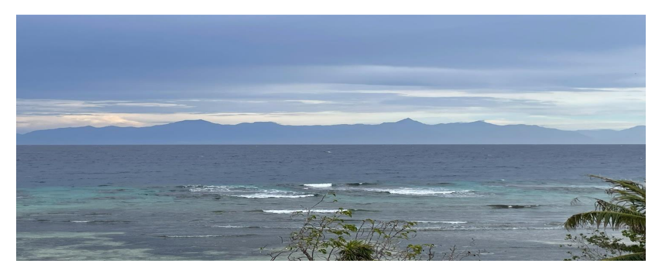
View of mainland Honduras from Utila

This summer I supported Operation Wallacea with coral reef conservation research in Utila, a Honduras bay island. The coral reefs in this area are under threat from various human influences, such as tourism, warming sea temperatures, plastic pollution, and ocean acidification. Additionally, the mangroves in this area are hugely degraded from human modification. Both coral reef and mangrove environments are incredibly rare ecosystems, providing a diverse range of biodiversity and habitats. Both systems also contribute to coastal flood management of the connecting communities by diffusing wave power and providing protection against erosion.