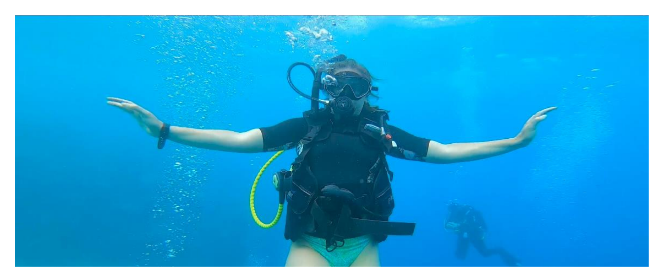
Learning to dive

Overall, the experience provided an invaluable insight into marine conservation and strengthened my appreciation for the natural environment. The expedition supported my degree in water and environmental management by considering a catchment-based approach to water management from source to sea. It also strengthened my field research skills and techniques.